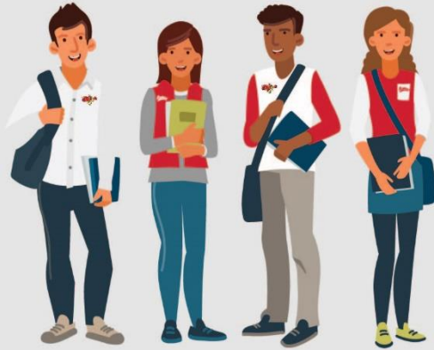
CCC MARKETING SCHOLARSHIP STUDENTS